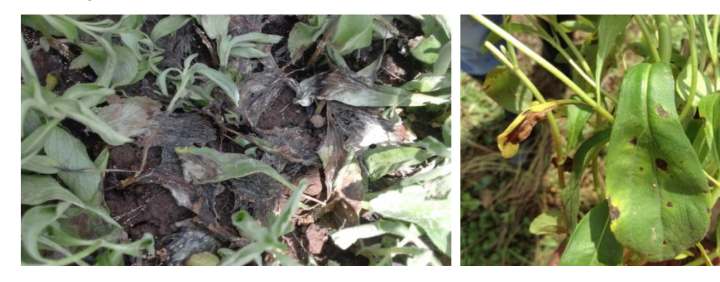
Pic 7: Septoria leaf sport of stevia

During our experiment it has been observed that young leaves and buds were attacked by caterpillars and chemicals like cypermethrin, deltamethrin were sprayed at a rate of 1.5-2.0 ml/L of water at 15 days interval to manage them.